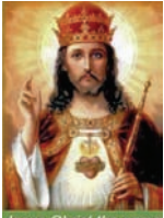
Jesus Christ the same yesterday, today and forever — Hebrews 13:8

The rhythm of the liturgical seasons reflects the rhythm of life — with its celebrations of anniversaries and its seasons of quiet growth and maturing. Ordinary Time, meaning ordered or numbered time, is celebrated in two segments: from the Monday following the Baptism of Our Lord up to Ash Wednesday; and from Pentecost Monday to the First Sunday of Advent. This makes it the largest season of the Liturgical Year.