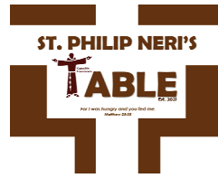
Table July 20 th & 21 st

The CWL will be collecting non-perishable food items on the weekend of July 20th and 21 st for St. Philip Neri's Table and Food Program. They are most in need of pasta, canned tuna, soups, corn, rice, dry or canned beans and tomato sauce. All non-perishable items are most appreciated too. This program is an outreach mission located in North York intended to help alleviate the food insecurity crisis affecting families in Toronto and surrounding areas. Collection boxes will be located in the foyer and the hall of our Church. Thank you for your generous contributions